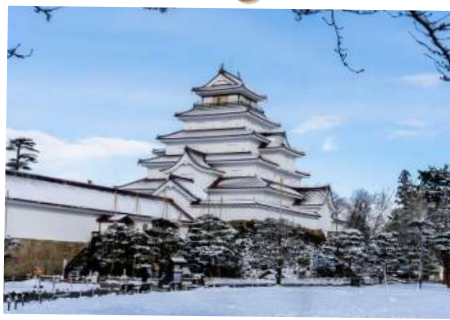
会津若松城 / Azuwakamatsu Castle