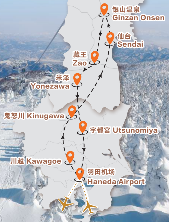
藏王树冰 Zao Ice Tree

※ Sequence of the itinerary is subject to change according to the final flight confirmation.