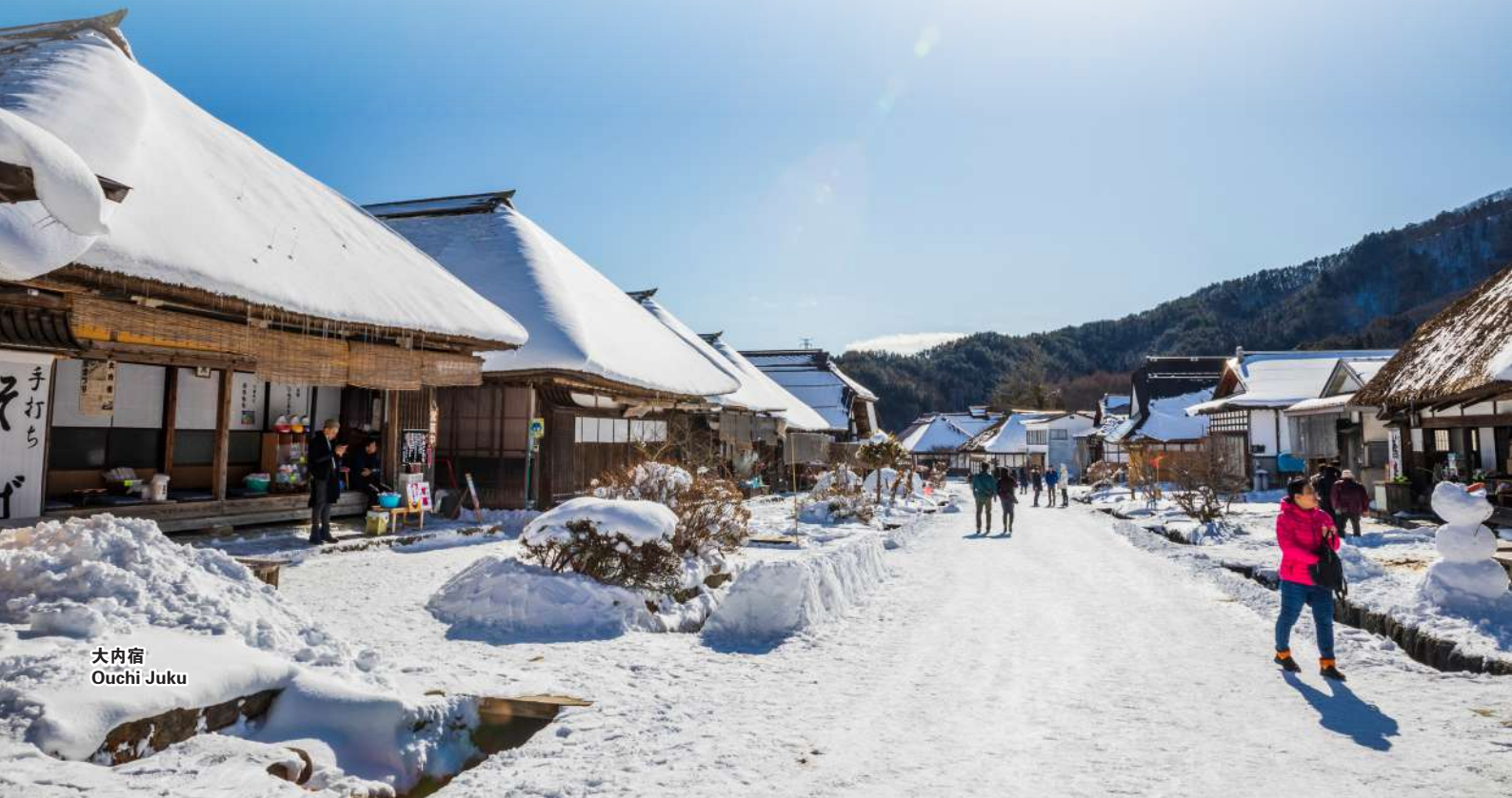
大内宿 Ouchi Juku