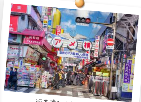
阿美横町 / Ameyoko