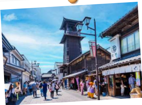
川越 / Kawagoe